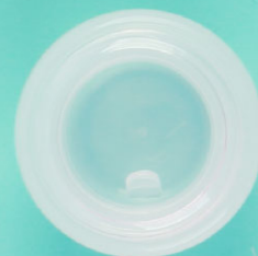
01 SA71027 Size: \phi 3.3 \times 2.4 \text{cm}