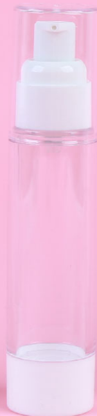
03 SA70501 Size: \phi 3.3 \times 15 \text{cm}