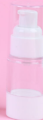
05 SA70503 Size: \phi 3.3 \times 10 \text{cm}