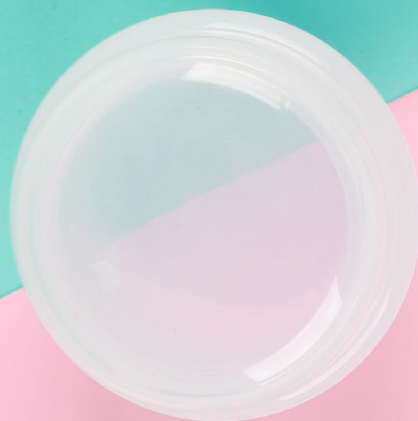
05 SA71022 Size: \phi 6 \times 4.7 \text{cm}