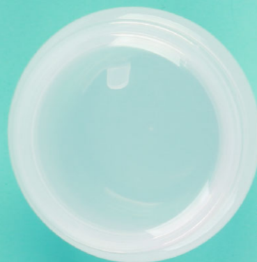
04 SA71021 Size: \phi 5 \times 3.8 \text{cm}

Suitable for cream products such as face cream, morning and evening cream.