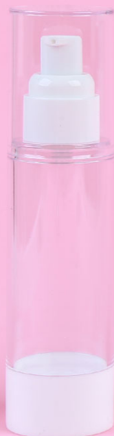
02 SA70500 Size: \phi 4 \times 15.8 \text{cm}