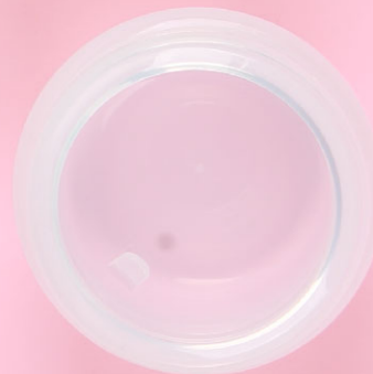
03 SA71028 Size: \phi 4.6 \times 3.2 \text{cm}