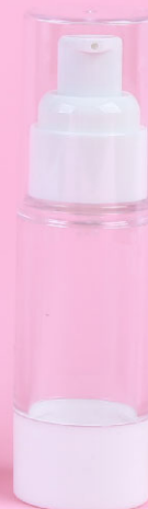
04 SA70502 Size: \phi 3.3 \times 11.8 \text{cm}