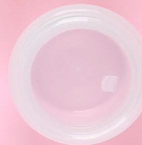
02 SA71020 Size: \phi 4 \times 2.8 \text{cm}