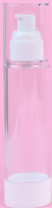
01 SA70499 Size: \phi 4 \times 17.8 \text{cm}

Isolate the air to reduce the oxidation of skin care products.